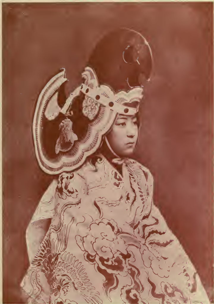
A "NO" DANCER IN COSTUME.